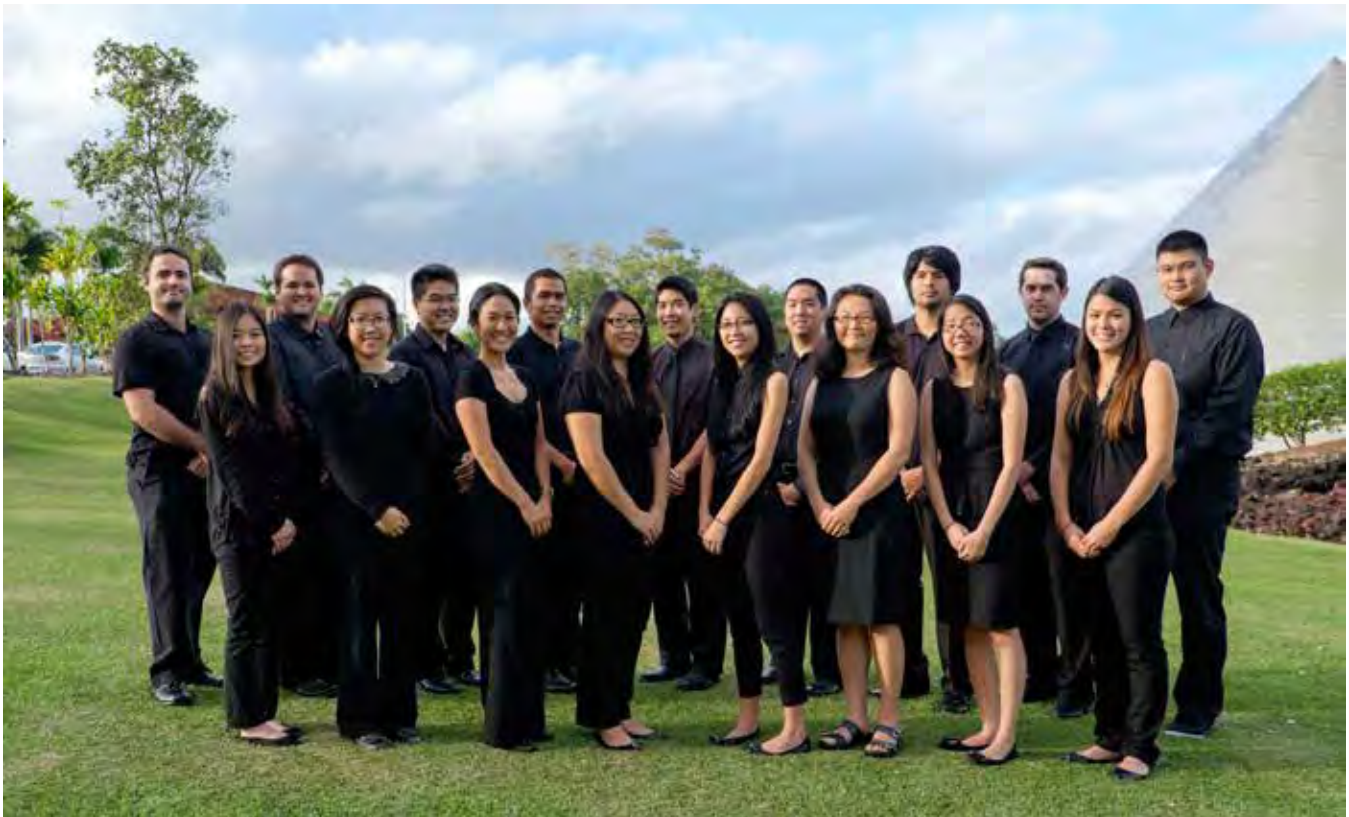
New members of Rho Chi