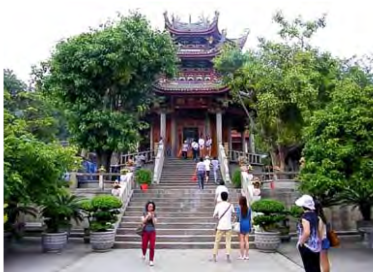
top photo: Xiamen University; Bottom photo: Zhejiang University