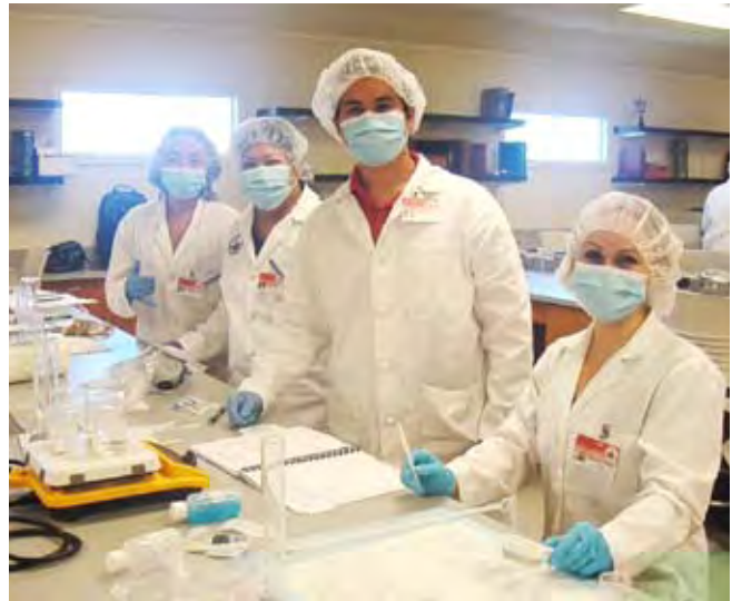
Student pharmacists add to compounding knowledge in workshop on UH Hilo campus.