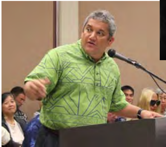
Mayor William "Billy" Kenoi testified on behalf of the College of Pharmacy to the Board of Regents before they voted on naming the College after the late Sen. Daniel K. Inouye.