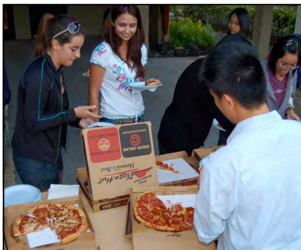
First-year students enjoy pizza at a meet & greet sponsored by Walgreens in January.