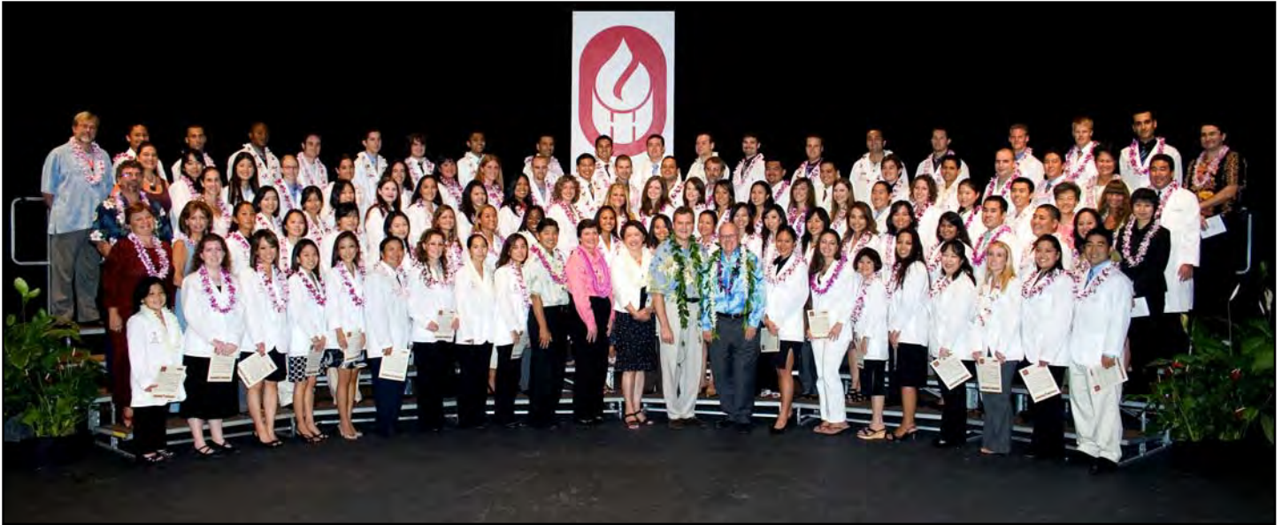
The College of Pharmacy's inaugural Class of 2011 celebrates at its White Coat Ceremony in October 2007.