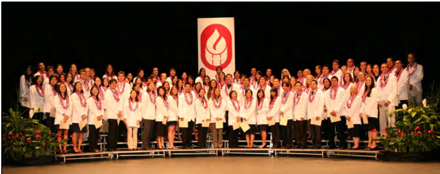
The Class of 2012's White Coat Ceremony took place in October 2008.