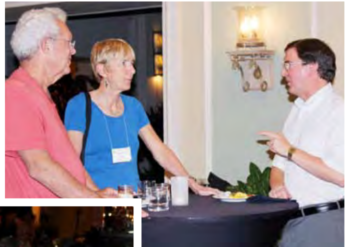
The conference gave participants opportunities to exchange ideas over meals and at buffets during the poster sessions.