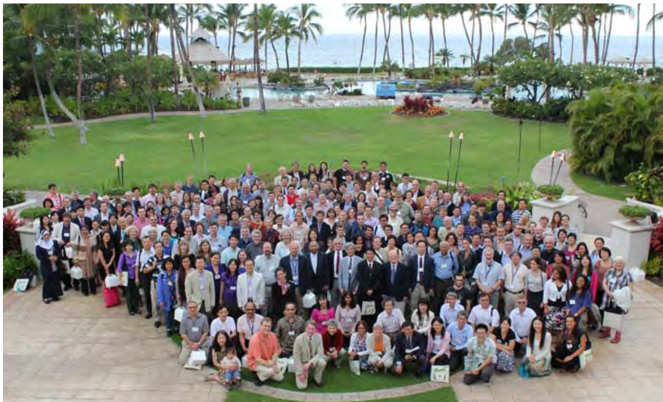
Participants gathered at the Fairmont Orchid Hotel on the Kohala Coast for a group photo at the 50th Annual Meeting of the Phytochemical Society of North America.