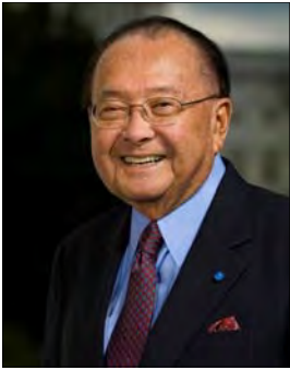
Sen. Daniel K. Inouye

The University of Hawai`i at Hilo's College of Pharmacy (CoP) will begin new health care initiatives in Hawai`i and the Pacific region and gain support for students thanks to a $1.5 million congressionally directed grant from the U.S. Department of Education.