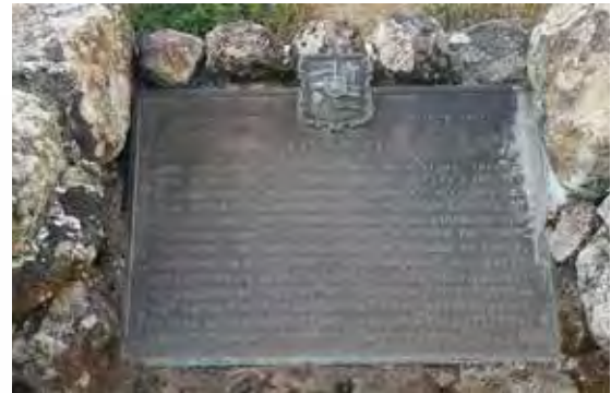
Plaque in Kalaupapa, Moloka'i