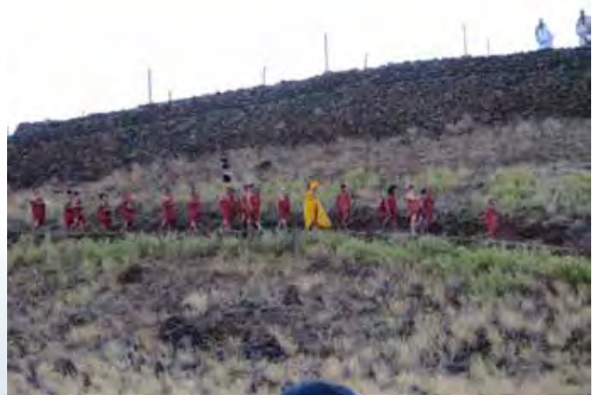
Ceremony at the Pu'ukohola Heiau National Historic Site in Kawaihae reenacts the day King Kamehameha unified the Hawaiian people of the different islands.

Many of the event participants do not have access to regular medical care, and this screening event may be their only visit to a doctor. Overall, the event was very successful, and PIMSC hopes to provide more screenings at next year's Ho'oku'ikahi.