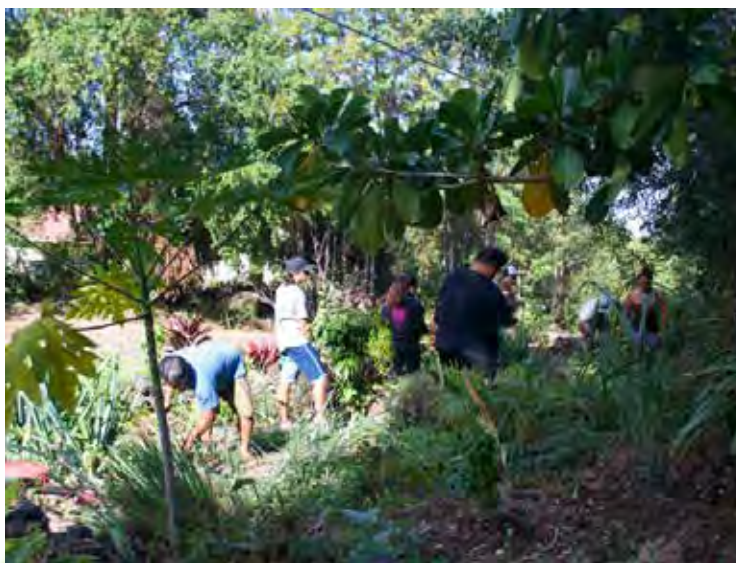
Working in the Māla