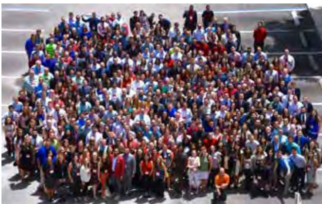
Brothers from Kappa Psi met for the 58th Grand Council Convention.

Brothers from all over the nation converge at one