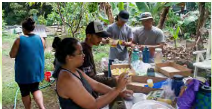
Compounding and making salves using Hawaiian medicinal plants