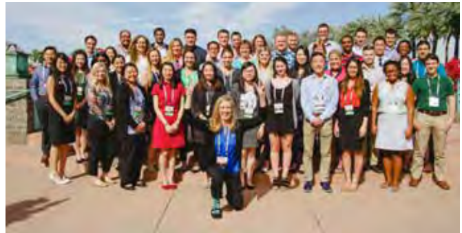
Attendees at IPC conference

During this three-day conference, there were up to 9.5 hours of continuing education courses and four hours of student presentations offered, which provided the latest information on independent pharmacy practice and ownership. There were also ample opportunities to network with current leaders in independent ownership, representatives from different independent pharmacy resources