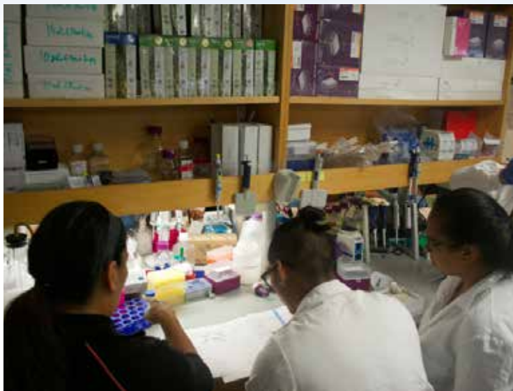
Laboratory work