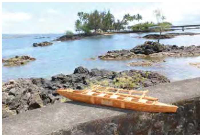
This miniature replica of wa'a Hokule'a was a gift to the College in 2013 from the Daniel K. Inouye Legacy Collection.